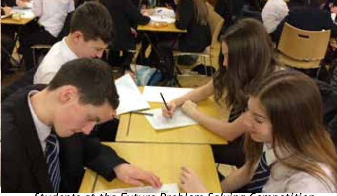
Students at the Future Problem Solving Competition