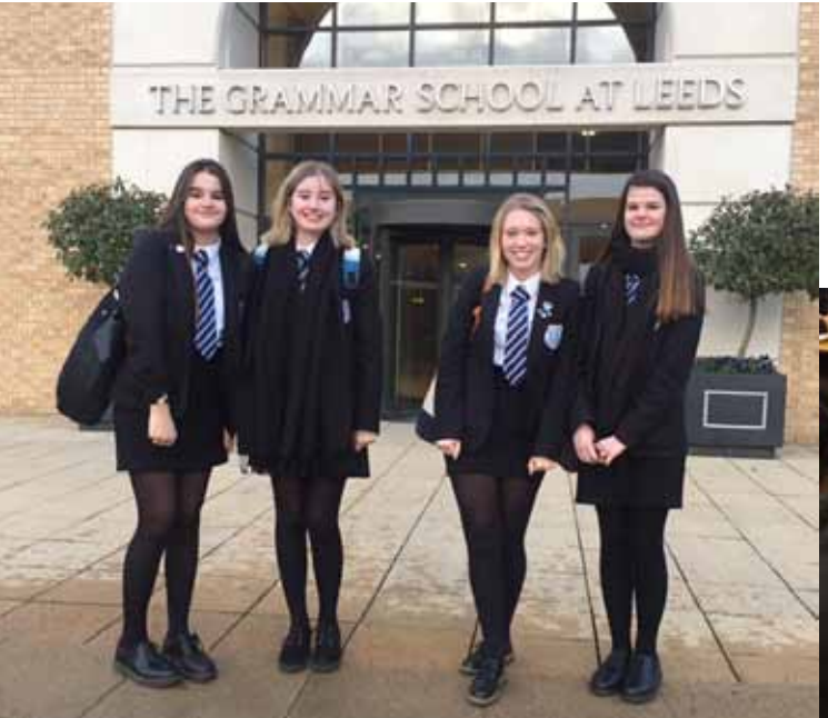
School Debating Team

Students of ALL abilities are collectively making excellent progress at BCA. We are very proud that all of this happens in such a caring, supportive environment. Whilst the nature of things is such that this can never be the experience of every individual, we will continue to work tirelessly to try and make it so.