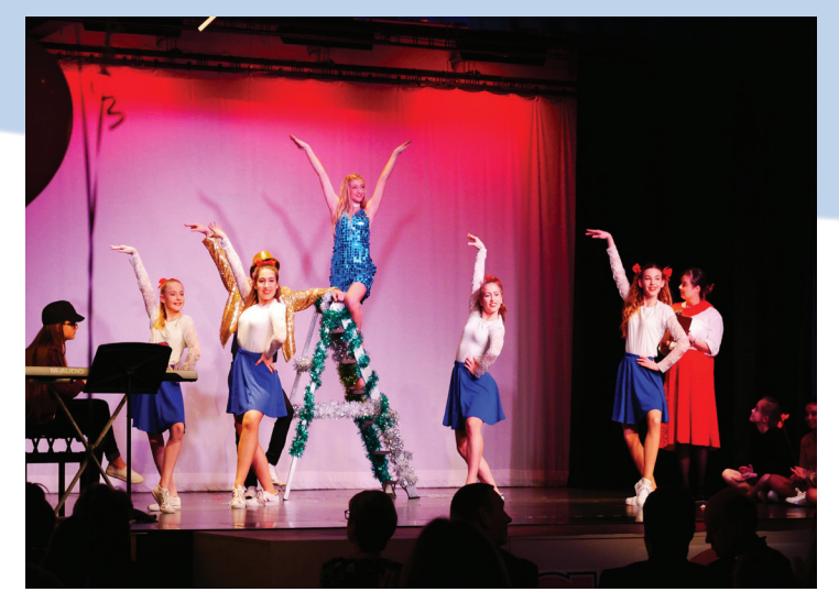
Being part of High School Musical has been amazing! I have really enjoyed being part of the show this year. But overall it has put my confidence level so much higher! Brainiac